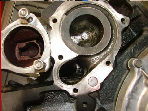
De burring of water jackets on a high performance motor, and particularly the middle large water gallery that has some large jagged bits which we remove to improve flow.