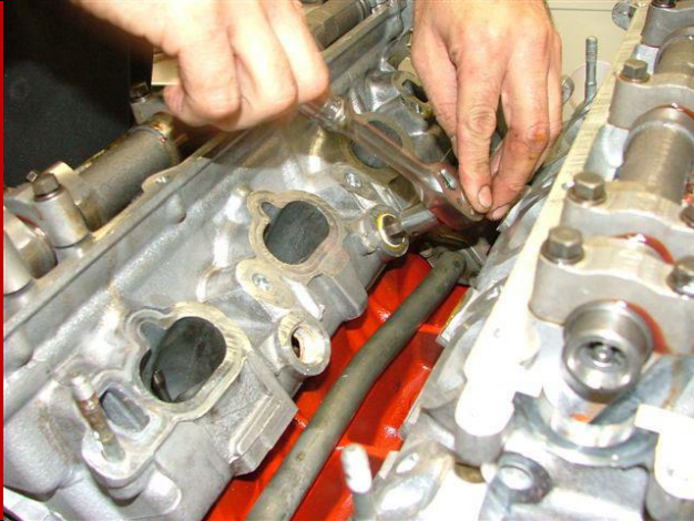
Water & oil gallery blanking plugs being put back in after heads were stripped and cleaned whilst rebuilding motor.