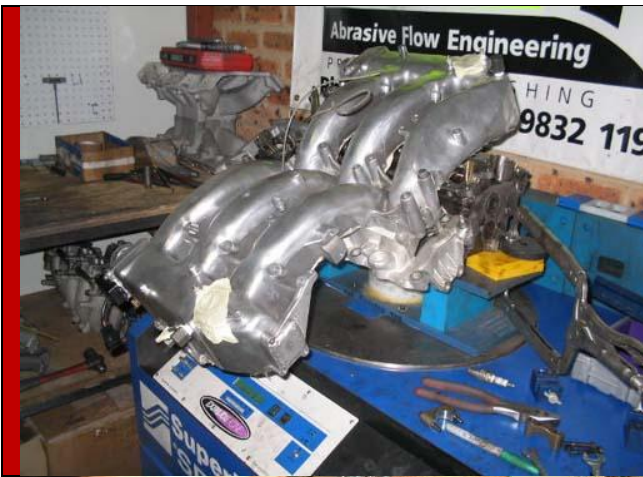
Flow bench test.